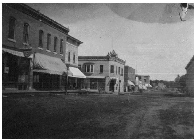
Downtown Crandon, 1910 ca.